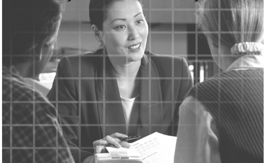
(MHP) . The MHP provides mental health services to all Sacramento County Mental Health Medi-Cal eligible children and adults.

We welcome you to Sacramento County Mental Health Plan